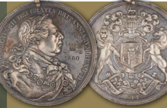
King George III Medal, silver, 1860, 1814.6576.15