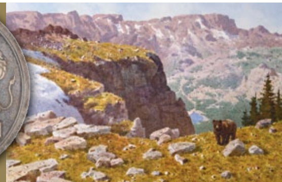
Rendezvous artist Joseph Bohler, Beartooth Pass - Montana, Watercolor, 25" x 36", (detail)