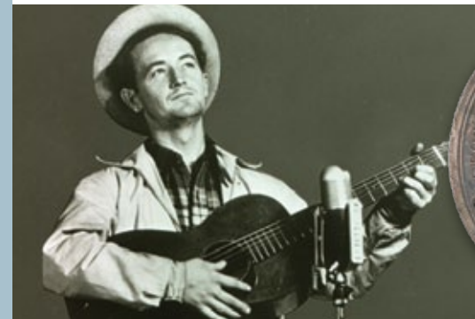
Woody Guthrie performing for CBS Radio, New York City, New York, November 19, 1940, (detail)